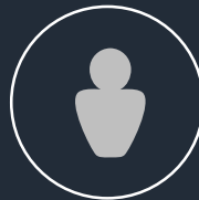
Head of Legal and Democratic Services (Deputy Monitoring Officer) VACANT